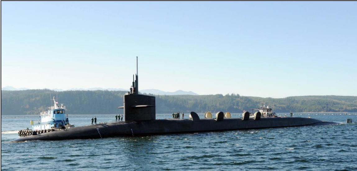
Figure 1. Ohio (SSBN-726) Class SSBN With the hatches to some of its SLBM launch tubes open