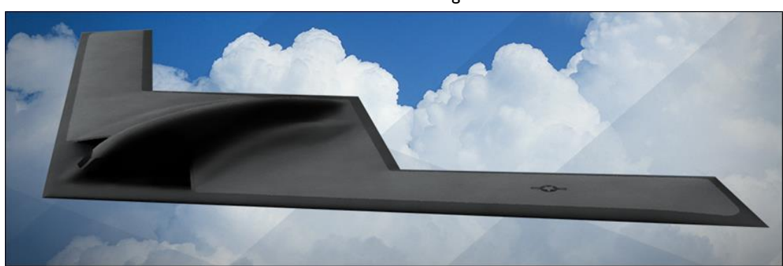
Figure 1.B-21 Artist's rendering

The B-21 is one of the Air Force's top three procurement priorities.<sup>3</sup>