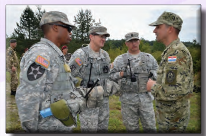
A U.S. soldier discusses training with Croatian soldiers for Immediate Response 15 in Slunj, Croatia. Immediate Response 15 is a multinational, brigade-level, Command Post Exercise utilizing computer assisted simulations and field training exercises in Croatia and Slovenia. The exercises and simulations are designed to enhance regional stability, strengthen partner capacity, and improve interoperability.

engagement with NATO allies to concentrate on bolstering Allied capabilities – especially the most recent members – to ensure that they are able to meet their Article 3 self-defense and Article 5 collective defense requirements. Under NATO's Readiness Action Plan, USEUCOM will continue to enhance the responsiveness of the NATO Response Force with pre-positioned stocks and related infrastructure to facilitate rapid reinforcement and manning for NATO command and control and associated enablers, which includes the enhancement of a corps- and division-level headquarters focused on assurance and adaptation measures. Lastly, USEUCOM will continue implementing the European Phased Adaptive Approach to provide protection to Europe from a potential ballistic missile attack from a rogue nation.