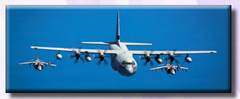
Two Spanish Navy Harriers fly behind a U.S. Marine KC-130J aircraft during an aerial-refueling exercise off the coast of Spain. The aerial-refueling capabilities of the KC-130J greatly extend the range and flight times of NATO aircraft.

Contributing to the complexity of the European security environment are financial challenges to the global economy. Although some individual European economies are healthy, others are weak, causing overall instability which threatens the prosperity of the trans-Atlantic community. In response to the global financial crisis and perceived lack of threats, European defense budgets have shrunk, resulting in reductions in capability, capacity, readiness, and interoperability with U.S. forces. Reduced budgets also make it more difficult for Allied countries to meet their obligations to NATO. The United States has similarly felt the effects of smaller defense budgets despite a high demand for its military capabilities around the globe.