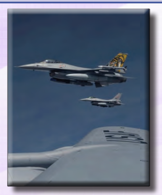
Two F-16 Fighting Falcons assigned to the Royal Norwegian Air Force fly alongside to the wing of a KC-135 Stratotanker assigned to RAF Mildenhall, England, while participating in the Baltic Region Training Event over the Baltic region. The BRTE is an advanced training concept that serves to further develop cooperation with NATO allies and partners within the region.

USEUCOM is engaged, postured, and ready with forward-deployed U.S. forces. We will enable and execute a full range of military missions in concert with our indispensable European Allies and partners to secure U.S. national interests and to support a Europe whole, free, and at peace.