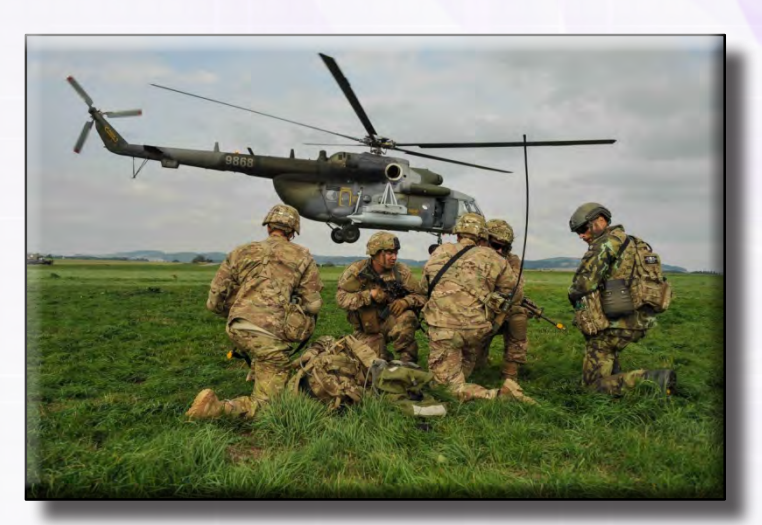
U.S. Army paratroopers and Czech army paratroopers seize an airfield during an air assault operation as part of Exercise Sky Soldier II at the Bechyne Training Area, Czech Republic. Sky Soldier is a series of bilateral exercises designed to increase interoperability and strengthen partnerships between NATO airborne forces.

capabilities, uncertain defense spending, and divergent strategic interests. Each individual nation's ability to meet their Article 3 self-defense obligations is central to NATO's credibility. The United States' Article 5 commitment to the collective defense of all NATO members is unwavering, as is U.S. commitment to ensuring that the Alliance remains ready and capable for crisis response and cooperative security. Our European allies and partners collectively remain our most vital global security partner and we continue to require co-investment in that relationship to sustain it for the future.