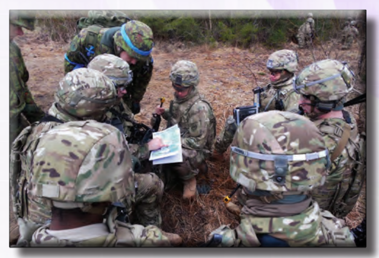
Dragoons maneuver through a forest toward a simulated enemy stronghold. Their mission was to capture a high value target as part of a combined training exercise with Estonian Allies in Rabassare, Estonia, in support of Operation ATLANTIC RESOLVE, an ongoing multinational partnership focused on joint training and security cooperation between NATO allies.

Russia is presenting enduring challenges to our allies and partners in multiple regions; therefore, it is a global challenge that requires a global response. USEUCOM will work with other combatant commands, the Joint Staff, and the Office of the Secretary of Defense to ensure that collective DoD deterrence efforts are synchronized and achieve the desired effect without causing unwarranted escalation or provocation.