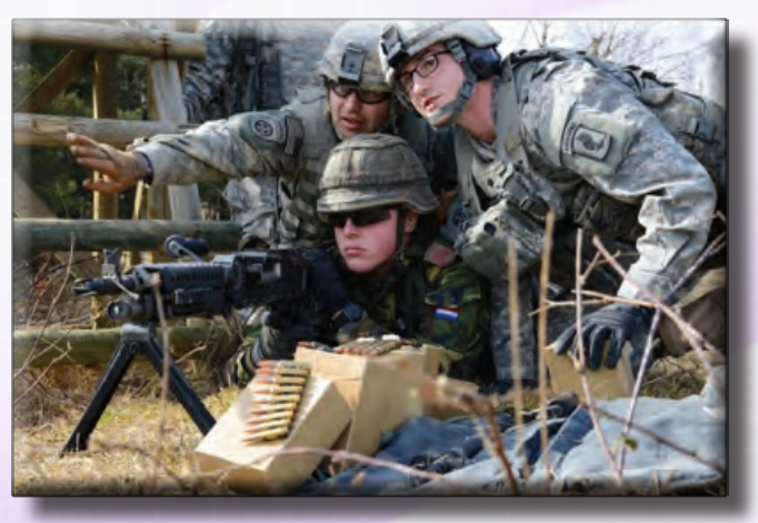
U.S. Army paratroopers and a Dutch soldier in the Royal Netherlands Army engage targets during a combined defensive live-fire exercise at the 7th Army Joint Multinational Training Command's Grafenwoehr Training Area, Germany. Army paratroopers routinely train alongside NATO forces to increase interoperability and strengthen the alliance

USEUCOM has spent the last decade enabling NATO members to participate in expeditionary operations outside of Europe. While this mission is still important, USEUCOM will shift its