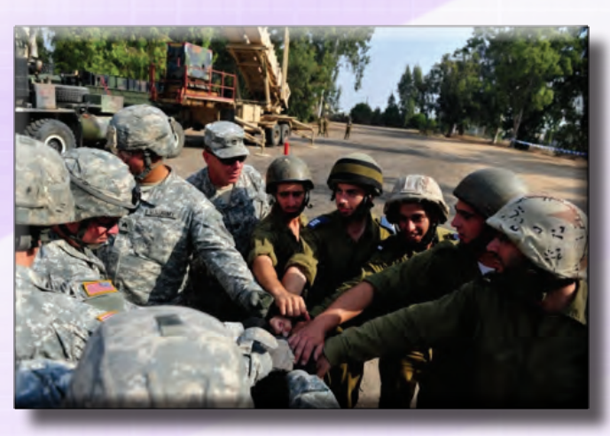
U.S. soldiers participate in the joint Austere Challenge Exercise with Israeli Defense Forces to develop partnered air and missile defense capabilities.

As reflected in the other priorities, USEUCOM will focus on key relationships by enhancing security in Eastern Europe and strengthening ties with emerging Alliance leaders. The Levant and the Mediterranean are also regions in which USEUCOM will be fully engaged. One of USEUCOM's core missions is assist Israel in its inherent right to self-defense. In addition to the threat posed by Iran and Lebanese Hezbollah, Israel resides in a dangerous and complex region due to the expansion of radical Islamic extremists organizations on Israel's border in both Syria and the Egyptian Sinai. Continued tensions between Israel and the Hamas-led government in Gaza have also led to open warfare in the past with no