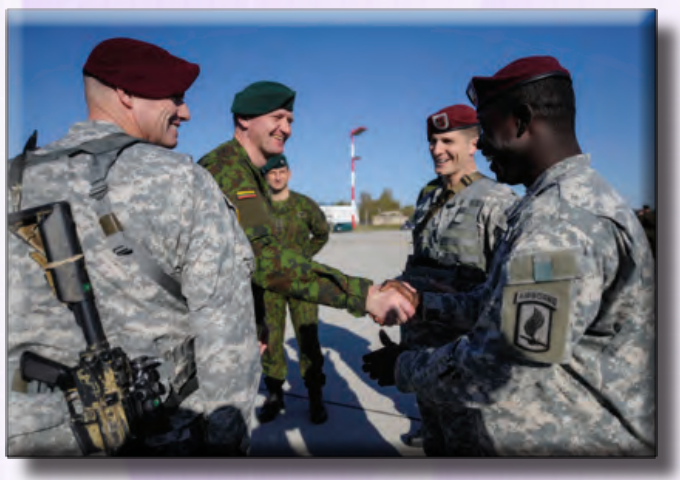
A Lithuanian general greets U.S. soldiers on Siauliai Air Base, Lithuania. Europe-based U.S. Army units were deployed to Poland, Lithuania, Estonia, and Latvia to conduct bilateral military exercises and reinforce NATO security commitments to the host nations.

While Russia has supported some common security efforts in counterterrorism and counternarcotics, these contributions are overshadowed by its disregard for the sovereignty of its neighbors in Europe and its violation of numerous agreements which require Russia to act within international norms. One of the United States' national military objectives is to deter state adversaries from threatening the U.S. homeland and U.S. interests while assuring the security of allies. Because Russian aggression threatens NATO allies and partners in Europe, USEUCOM is leading Department of Defense (DoD) efforts to deter further Russian actions that